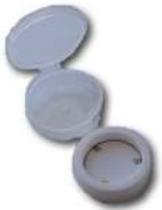
Filter Case and Filter