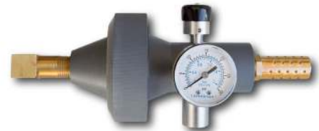
PVC Filter Holder Assembly