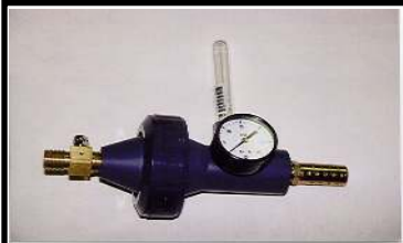
Complete Assembly with Sample Bottle

While the air is still flowing, remove the sample bottle (DO NOT TWIST) and replace the white sampling cap with the black shipping cap. The sample must be returned with the black cap tightly in place or the sample will not be analyzed.