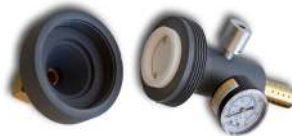
Both Halves of PVC Filter Holder Before Final Assembly