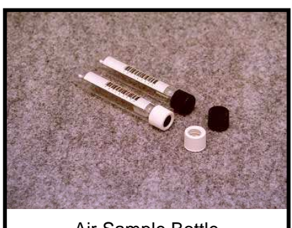
Air Sample Bottle