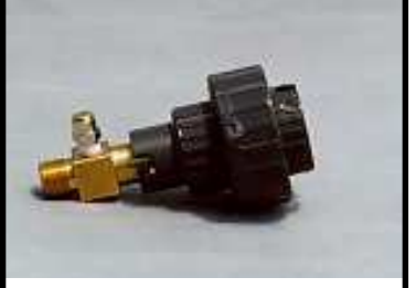
Input Fitting connected to Filter Union