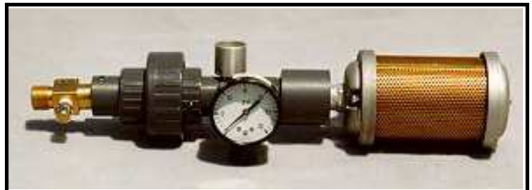
Input Fitting connected to Filter Union connected to the Flow Section