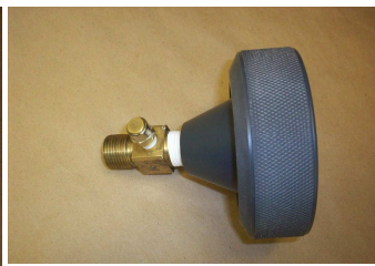
Input Fitting connected to the PVC filter holder