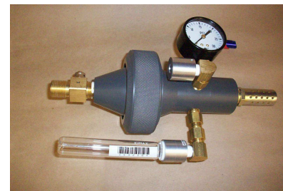
Complete Assembly with Sample Bottle

Connect the complete unit to your air source. After connecting the complete unit to your air source, choose a sample bottle and record the bottle number on the data sheet under "Breathing Air Sample". Remove the black sealing cap and replace it with the white sampling cap. Insert the bottle into the fitting containing the needles, by pressing straight onto the needles. DO NOT TWIST the bottle or the needles will be damaged.