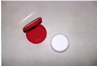
Filter Cup and Filter

1 Start the compressor and allow it to run with air flowing from the sampling point for at least 5 minutes before sampling. While the compressor is running complete steps 2, 3 and 4 of these instructions.