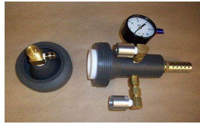
Both Halves of PVC Filter Holder Before Final Assembly