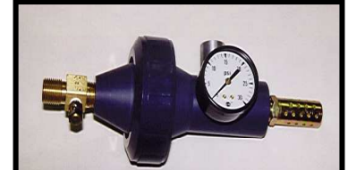
PVC Filter Holder Assembly