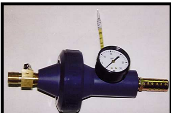
Complete Assembly with Moisture Tube inserted

Locate the moisture tube and find the end marked (insert other end). Caution: Wear eye protection to avoid injury from flying glass. Carefully break the glass tip off this end by inserting it into the hole on the side of the tube fitting and gently applying sideways pressure. Then, break the other tip off using the same procedure.