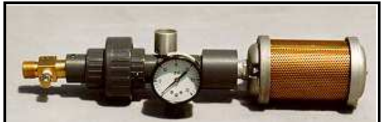
Input Fitting connected to Filter Union connected to the Flow Section