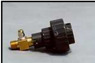
Input Fitting connected to Filter Union