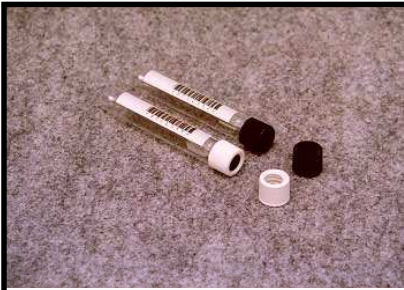
Air Sample Bottle