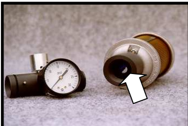
Flow Section opened to show orifice plate

Record the filter number on the data sheet under "Oil Mist/Particulate Sample Data." The filter number can be seen by removing the orange cap plugs on both ends of the filter union. Locate the number etched on the metal screen beneath the larger orange cap plug. - DO NOT UNSCREW THE FILTER UNION