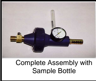
Complete Assembly with Sample Bottle