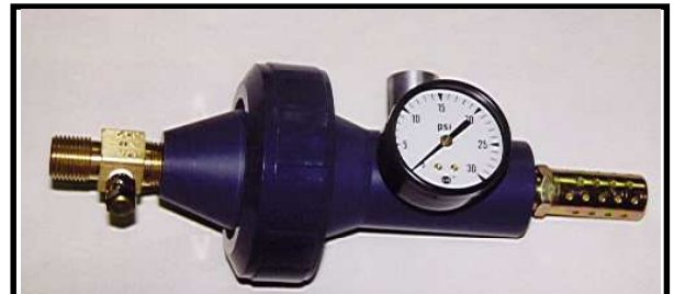
PVC Filter Holder Assembly