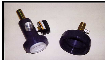
Both Halves of PVC Filter Holder Before Final Assembly