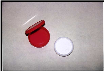
Filter Case and Filter

If a moisture sample is to be obtained, go to moisture sampling instructions and perform the test before continuing with this air sampling instruction. Start the compressor and allow it to run with air flowing from the sampling point for at least 5 minutes before sampling. While the compressor is running complete steps 2 and 3 of these instructions.